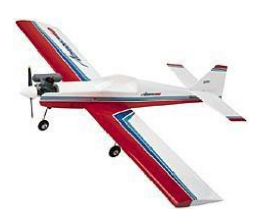
Hangar 9 Advance 40, 60" ws, Trike gear sport plane Enya 54. Mfg photo but mine is almost identical Airtronics black electronics