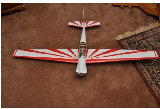
Model of Fournier RD-4, I think. Motor glider, 4 channel, perhaps 50" ws. Out runner. Needs 3S1600 LiPo