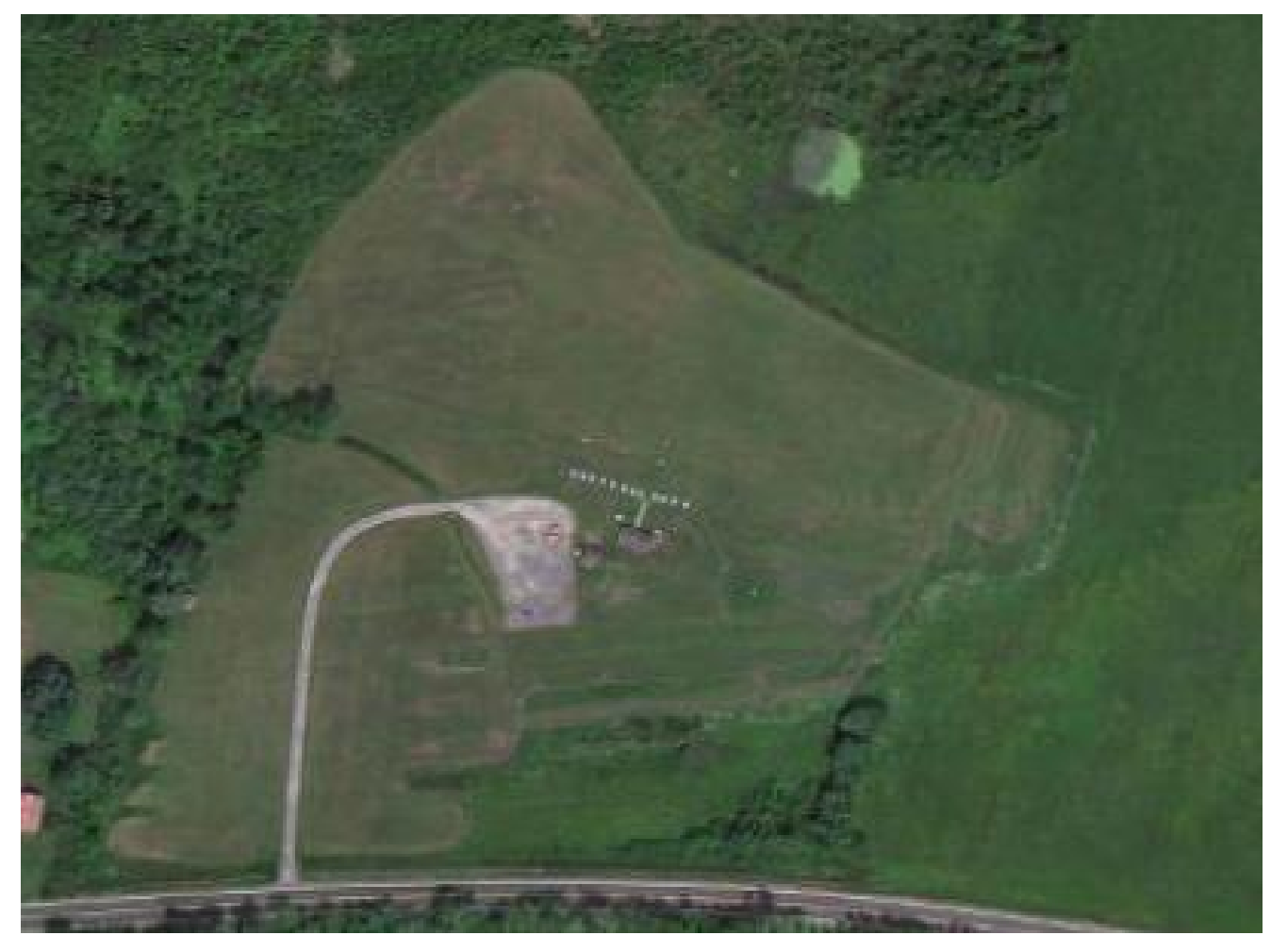
STARS Field Satellite photo