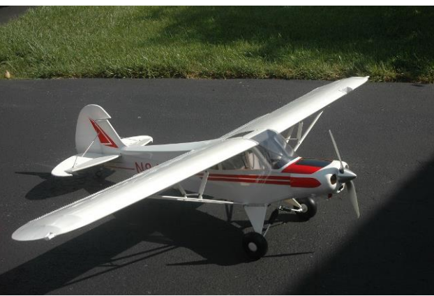
Electifly Super Cub. 68" electric. Flown only for MAN review. 5 channel, inc. flaps. Uses 4S 3200 mAH LiPos