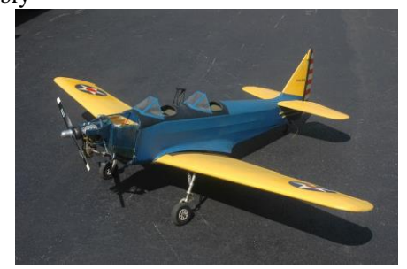
P-19, 80" WS. Powered by OS/120. Color matching cowl Nelson glow driver