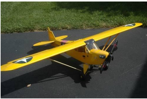
Great Planes Cub ARF. 80ö WS. Glow powered w McDaniels glow driver