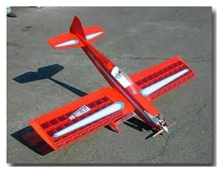
BTE Venture 60 (mfg photo). A sweetheart of a plane. Glow, Enya 74? Mine is covered similarly. 72ö ws Airtronics black electronics