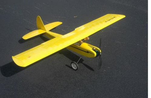
SR Batteries Cutie. 46 " ED, geared brushless, 4 channel. A fun plane to fly. I may keep it.