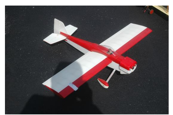
Lanier Stinger 10, 4 channel, 36" wing span. Out runner motor available with it.