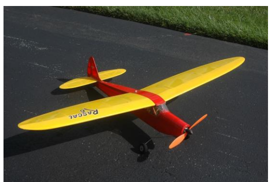
A Sig Racal C, 47" ws, three channel, out runner motor. Removable wing. Fun little toss around the sky plane. Needs 2S1200