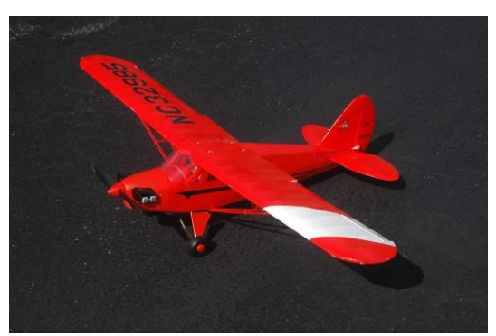
Hobby Lobby J-5. 43" ws, EPO foam construction. Minor LG damage. Flies on 2S1600 LiPo; 2 included